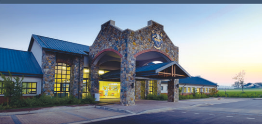
Reddam House Helderfontein Reception: 010 060 4232