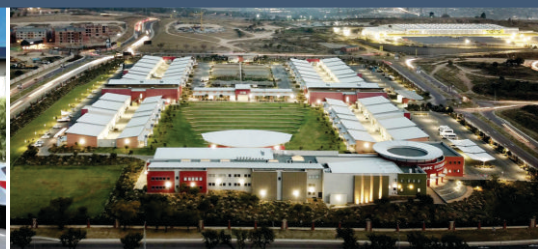
Riversands Incubation Hub Reception: 011 012 4600