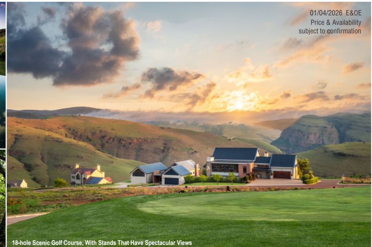
18-hole Scenic Golf Course, With Stands That Have Spectacular Views

01/04/2026 E&OE Price & Availability subject to confirmation