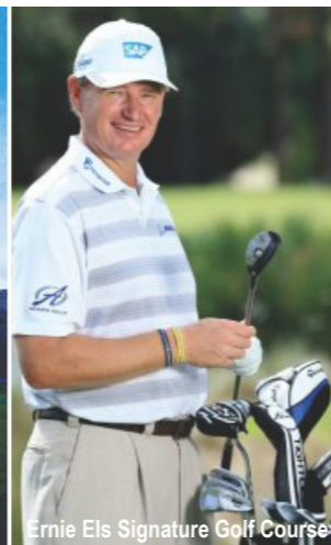
Ernie Els Signature Golf Course