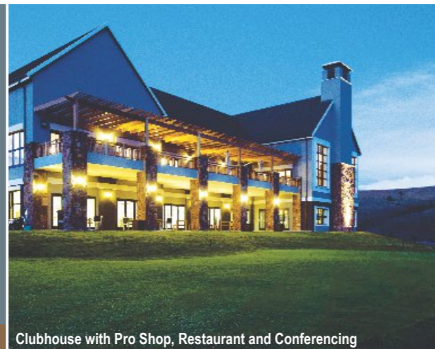
Clubhouse with Pro Shop, Restaurant and Conferencing