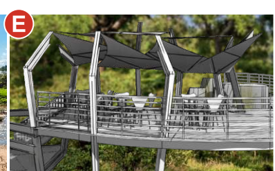
3x Bird Hides