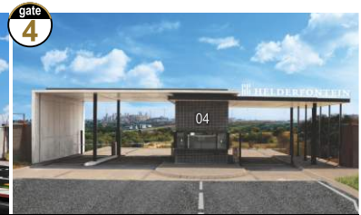
4x Secure Estate Gate Houses, manned 24/7