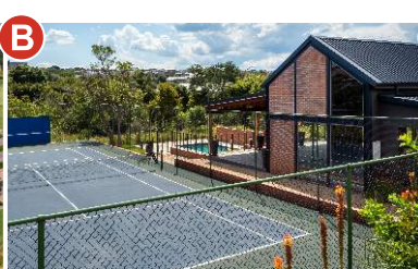
Riverside Retreat with Tennis Court