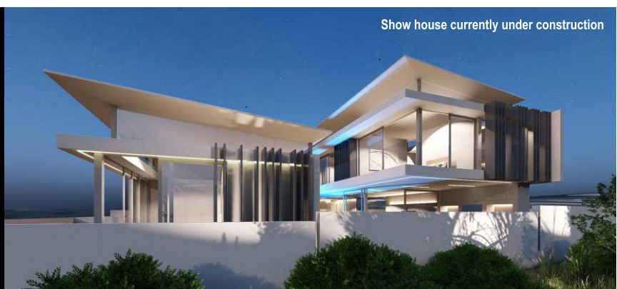
Show house currently under construction