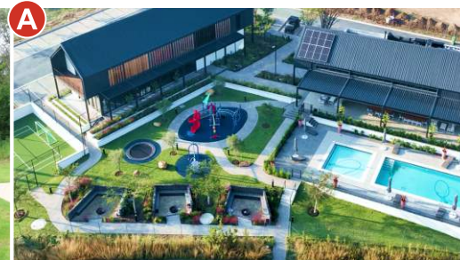
Estate Clubhouse: Restaurant and Gym