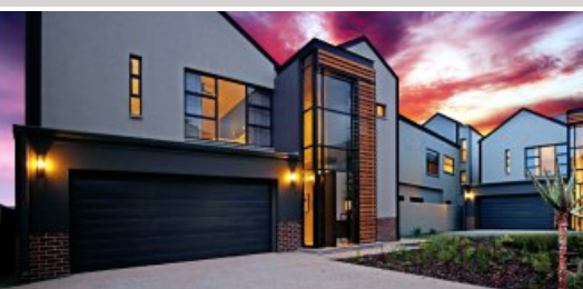
The Villas, Waterfall Georgia: 083 644 4323

Other exciting RENTAL projects currently on show by Century Property Developments: