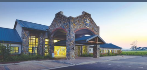
Reddam House Helderfontein Reception: 010 060 4232