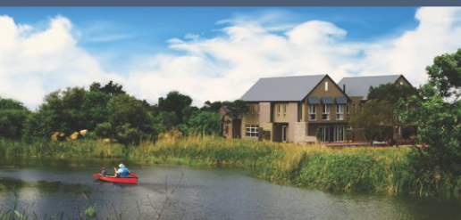
Helderfontein Residential Estate Vee: 082 937 1680

Other components in this precinct - by Houss Rentals, Century Property Developments and other partners: