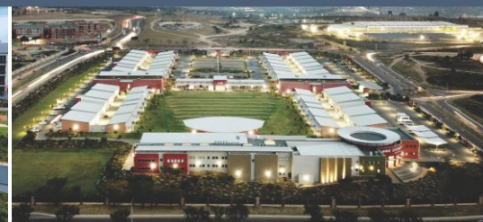
Riversands Incubation Hub Reception: 011 012 4600