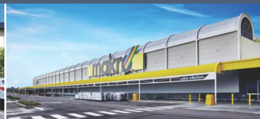
Makro Riversands Switchboard: 0860 600 999